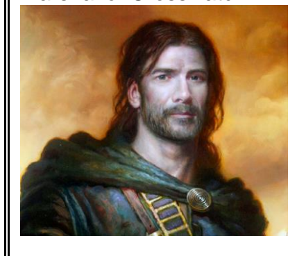
MARSHAL CORT MABRYN Marshal of Crosswatch

Quote: "It takes more than a sword to make a soldier."